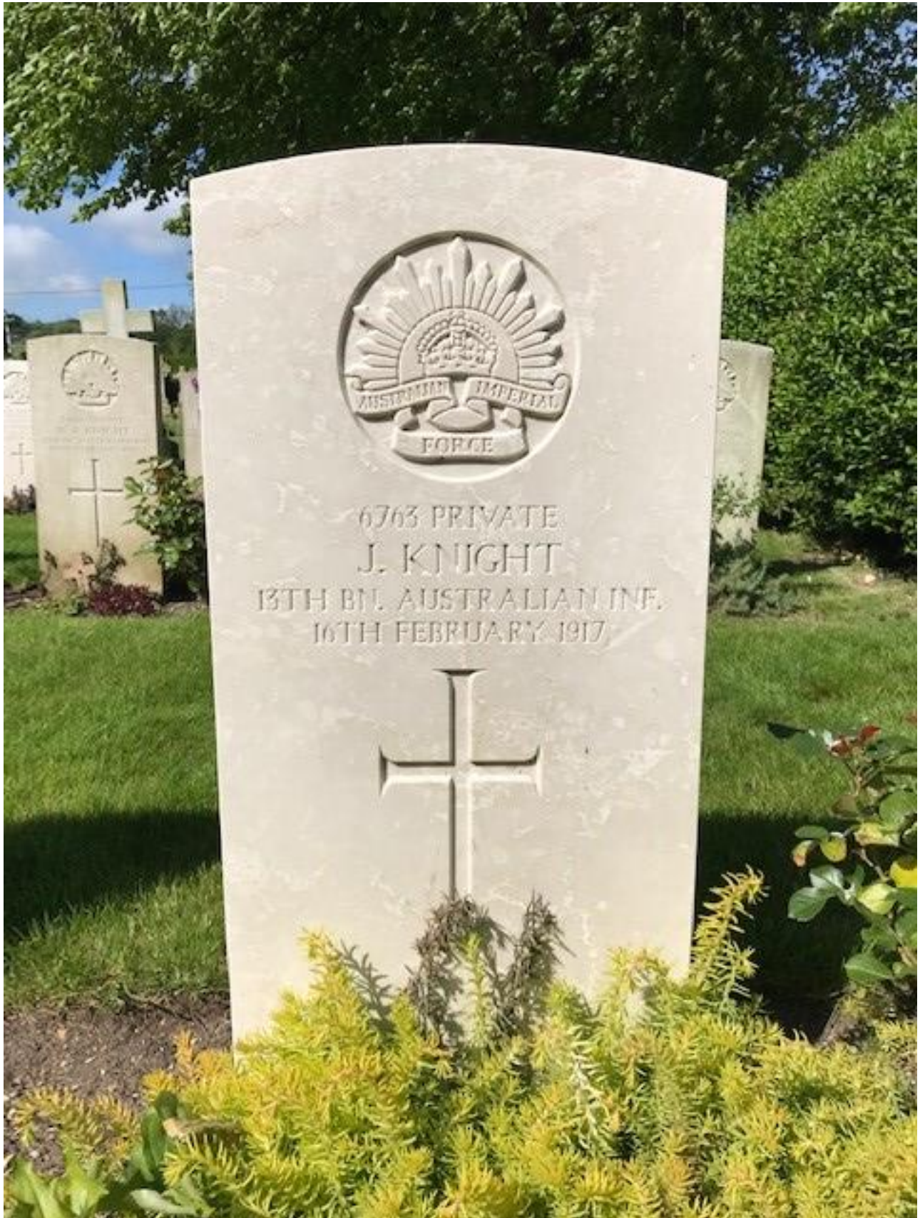
Photo of Private J. Knight's Commonwealth War Graves Commission Headstone in St Lawrence's Churchyard, Stratford-sub-Castle, Wiltshire, England.